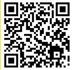
PAPERFISH ESPANOLA WAY